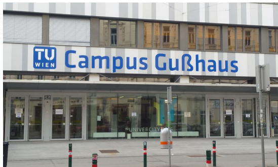
(C) Campus Gußhaus, Venue of EMI 2024 IC