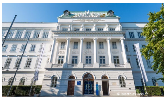
(A) Main Building of TU Wien, Venue of Welcome Cocktail